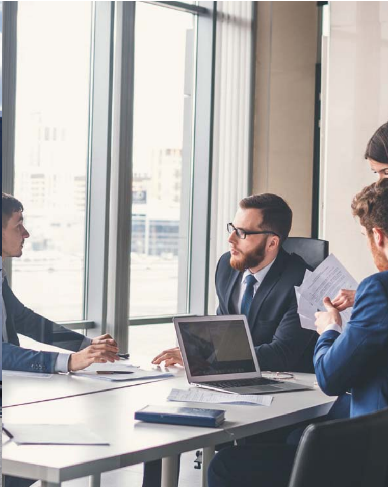
Incentives & conferences services