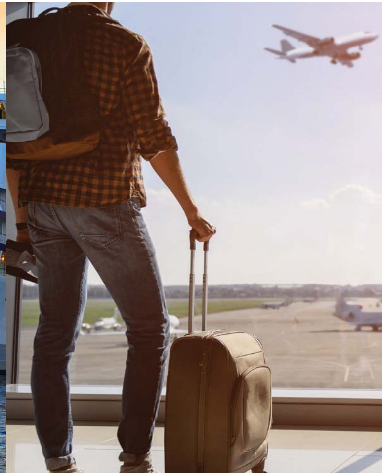
Cultural, Religious, Overseas and Educational travel