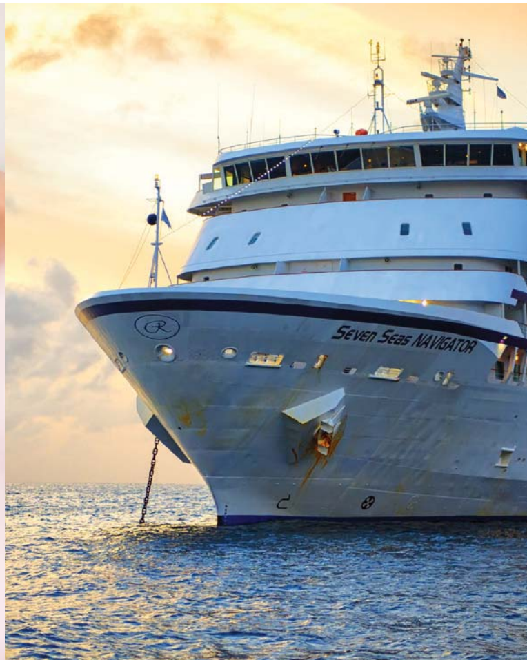
Cruise lines ground handling