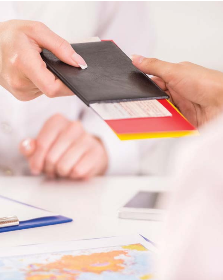
Incoming tour operator